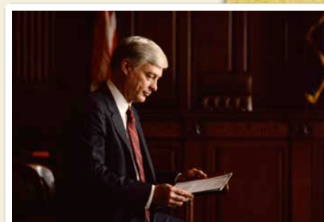
Look at the jury, not at your notes!

Use Presentation Mode in PowerPoint. In presentation mode, your laptop projects images onto two different monitors: the projection screen and your laptop monitor. The jury only sees the images projected on the big screen.