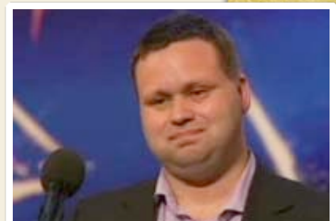
Watch Paul Potts in action as he sings “Nessun Dorma,” and you’ll see a dynamic attention grabber

But then something amazing happens. He opens his mouth and begins singing “Nessun Dorma” from Puccini’s Turandot :